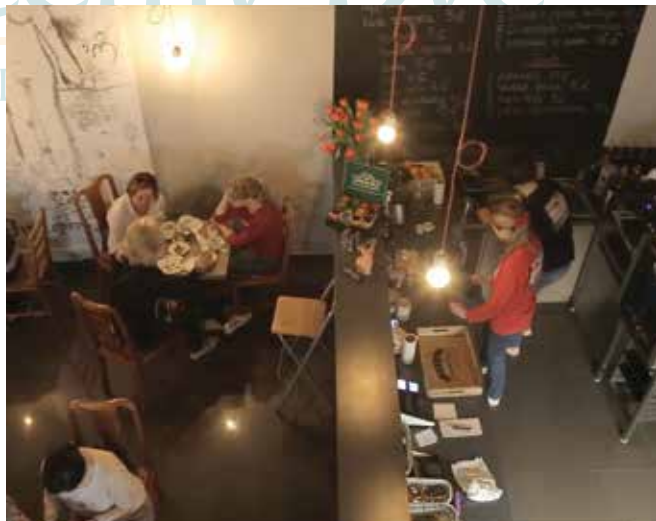
... as well as bartending and waiting.