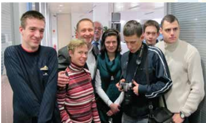
With Kamil Durczok at TVN television station studios