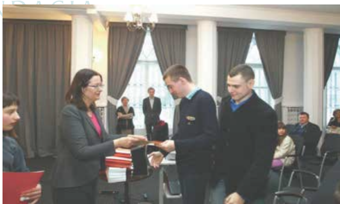
Our protégés receiving a special word of thanks for taking part in the video making