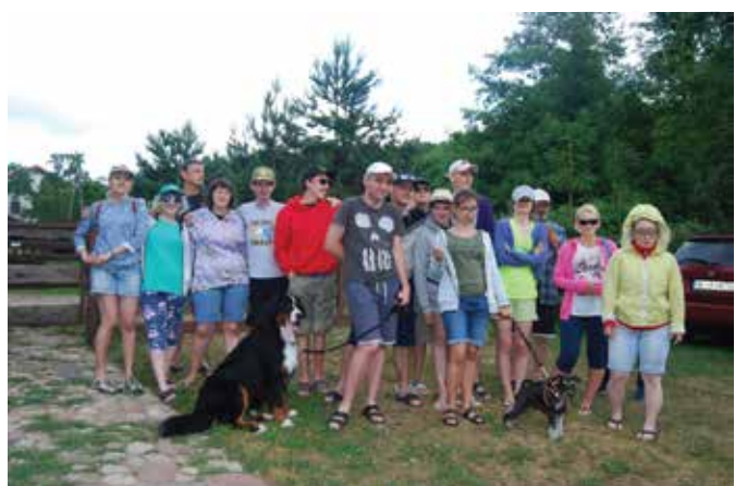
A trip to the Masurian district