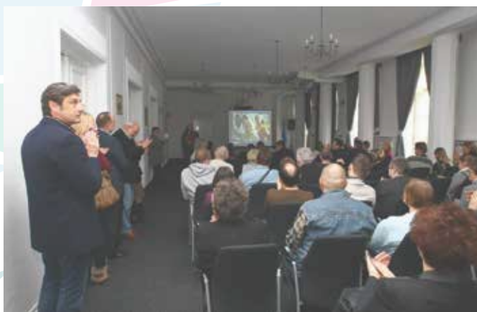
Formal presentation of the spot at the commissioner's office