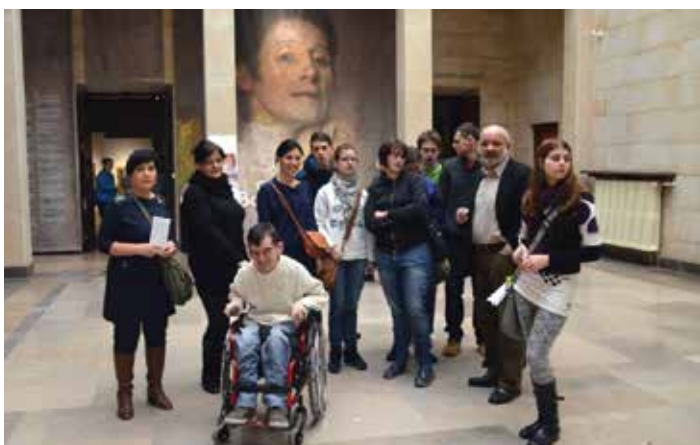
Frequent trips to museums and exhibitions