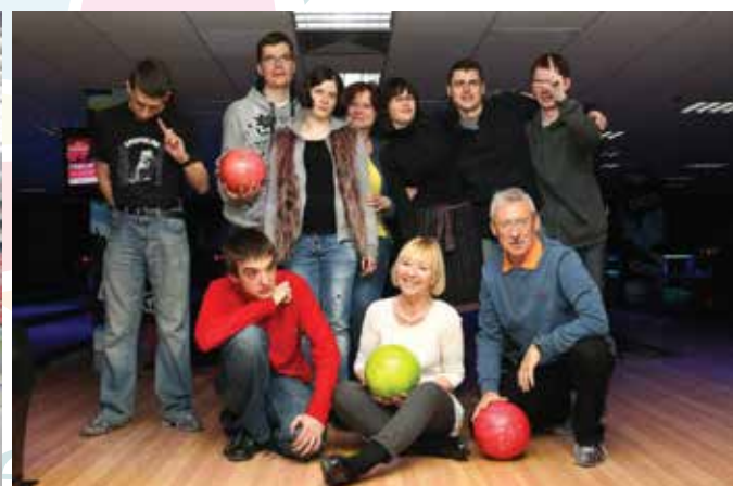
...and to the bowling alley