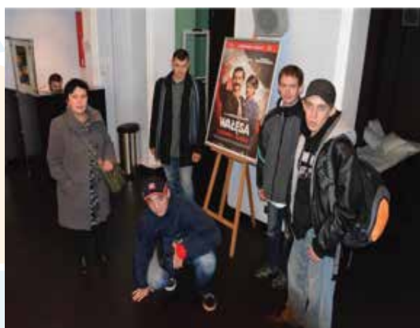
Going to the movies