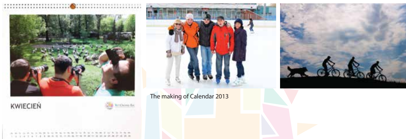
The making of Calendar 2013

We shot the photos for the calendar during various outings and excursions organized for our Foundation's protégés, which included an ice skating rink, a zoo, a cycling trip and a basic course in horse riding.