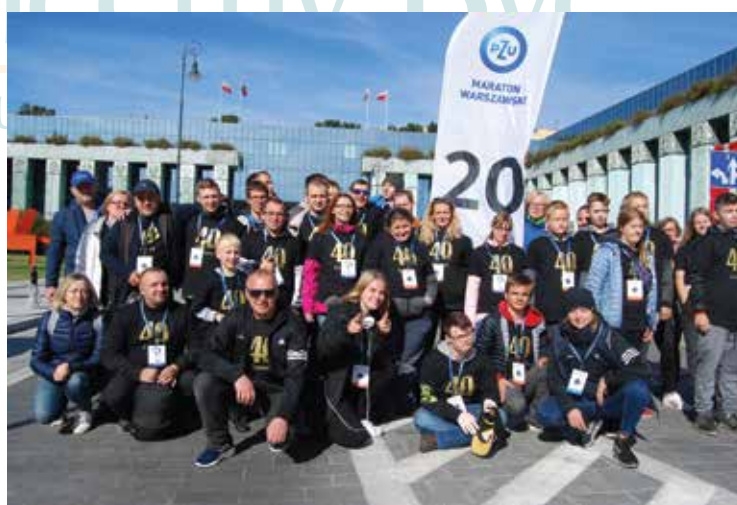
Real experts in organising sport competitions