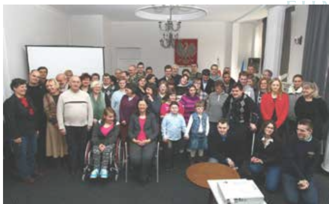
Among the guests of the ceremony