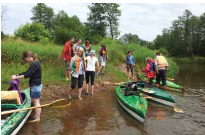
Canoeing down the Liwiec river