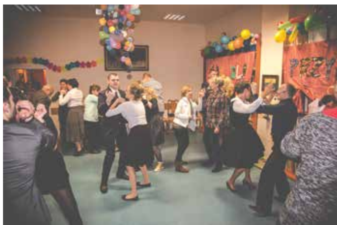
The Ball for our Friends

Among others we organized a kayaking trip down the Liwiec river, an excursion to Biebrza basin and a picnic at Powsin park. Every year during the winter season we regularly go ice-skating. We also celebrate together all the birthdays of our protégés and go bowling. We have been with a visit at the National Stadium and the go-carting track. One of our traditions is a „Ball for Friends“, which we have been holding since 2014.