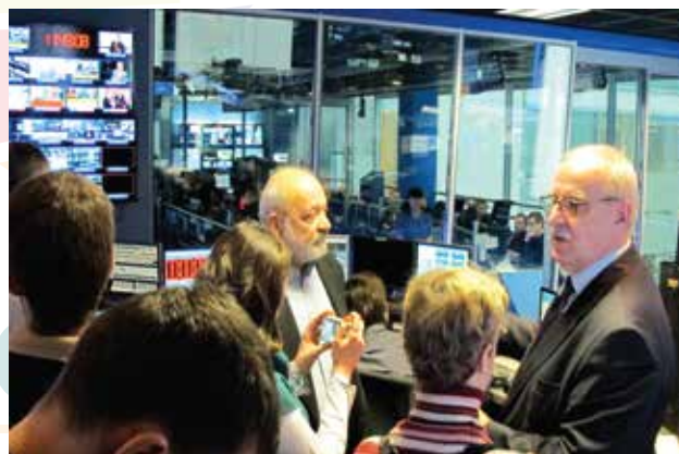
Behind the scenes of a news broadcast