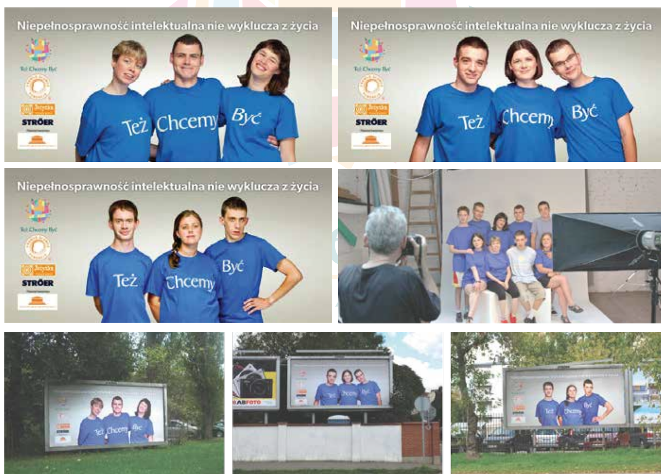
Social campaign „We Also Want to Be“ in the streets of Warsaw and Wroclaw