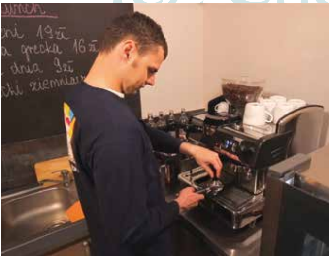
Very skilful at making coffee...