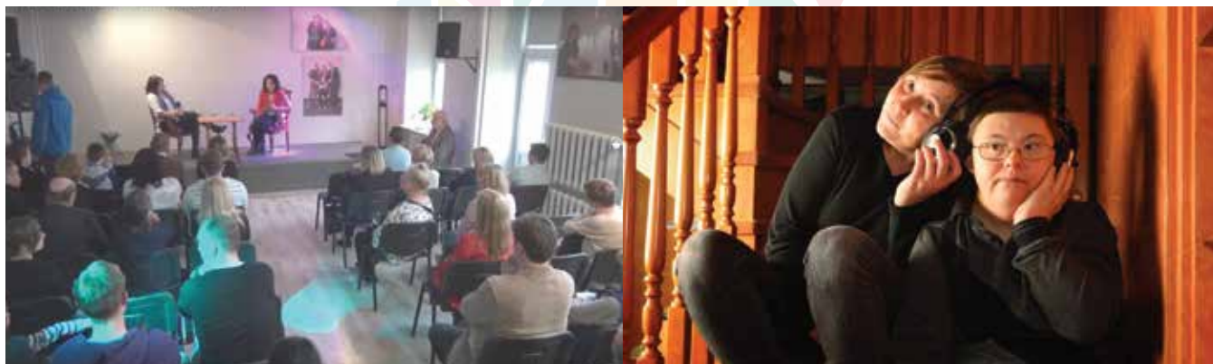
The conference on the problems of siblings of people with disabilities

The video clip can be viewed here: http://bit.ly/mojbrat-mojasiostra