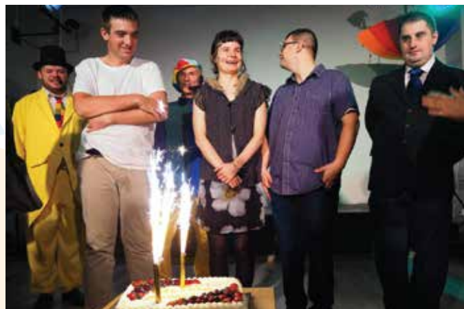
Celebrating birthday of one of our protégés