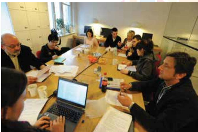
The first assembly of the cooperative members

And this is how the idea of creating a Social Cooperative „Pozyteczni (Useful*)“ came to life. And it is within its framework that the Café Club „Pozyteczna (Useful*)“ has been open in Warsaw for the last two years.