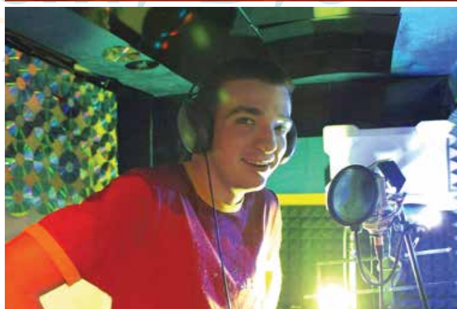
Recording a Christmas carol