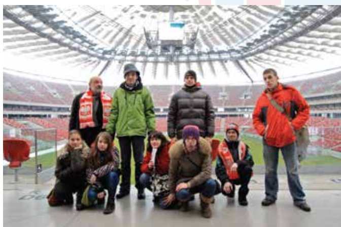
An excursion to the National Stadium...