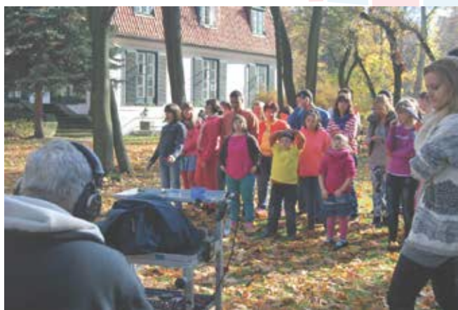
On the set of the spot of Polish Commissioner for Human Rights