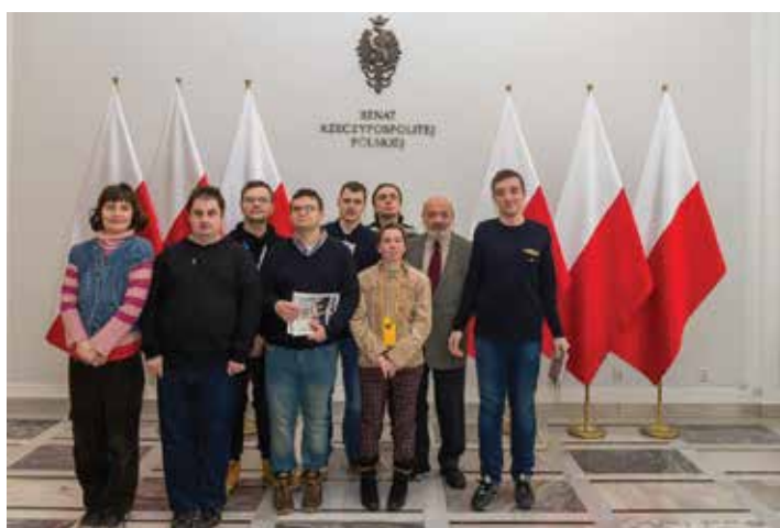
An excursion to Polish Parliament

This is the reason why we organize regular outings of all sorts, mount exhibitions, visit museums. Our protégés had the opportunity to visit the TVN studios, observe from the wings the work of famous TV presenters and journalists. They also visited the Polish Parliament.