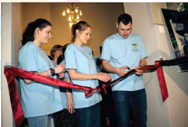
Grand opening of „Pozyteczna“ (Useful Café)